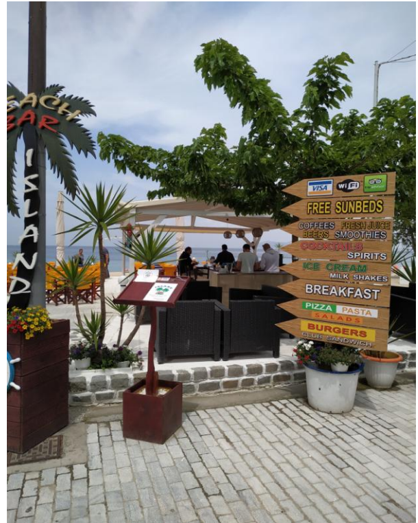
modern town of Thassos, a famous greek holiday destination.