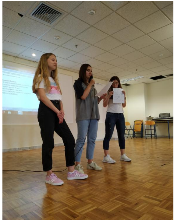
Students presented their activity.